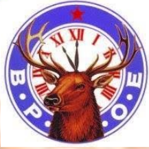
ELKS LODGE 2582