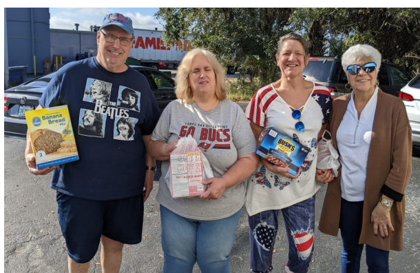
St. Paul the Apostle Old Catholic Church members provided a generous donation of food.