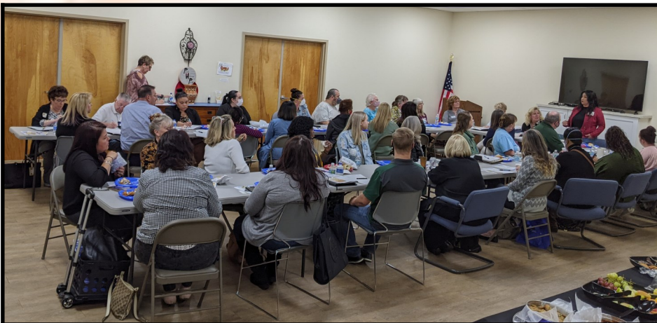
People from agencies around Hernando County attended the Community Connections Conference to network and find resources for their clients.

Weekend Blessings is supported by grants from the following: