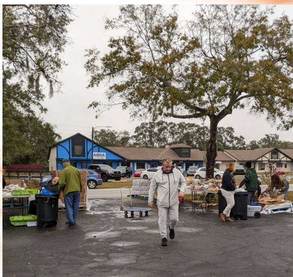
Volunteers set up for the mobile food distribution on a very rainy January 26. Our next food distribution is Wednesday, Feb. 23 at 10:30 am.