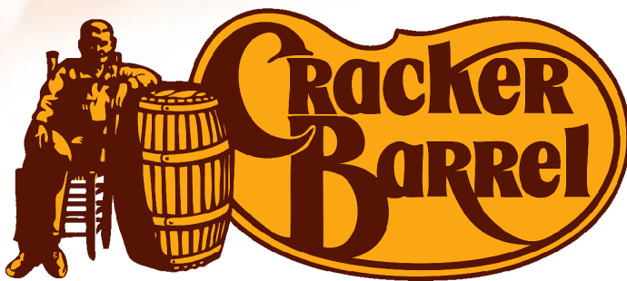
Old Country Store

Please show your appreciation by supporting these fine establishments and organizations.