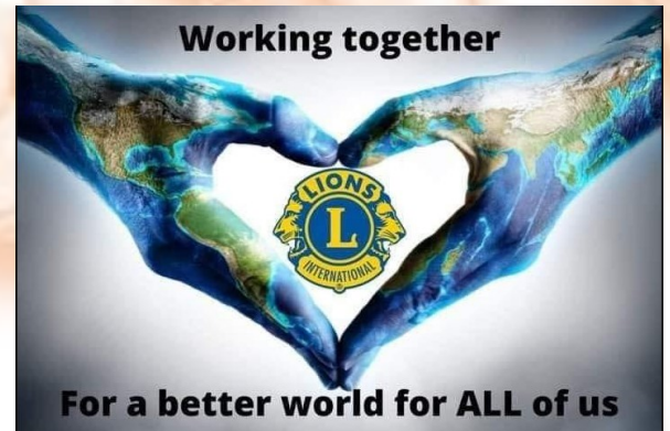
High Point Lion's Club