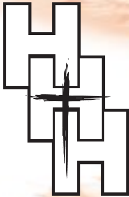
Hernando County Hispanic Heritage

Sunday Blessings Meal Sponsors - March THANK YOU!!!!!